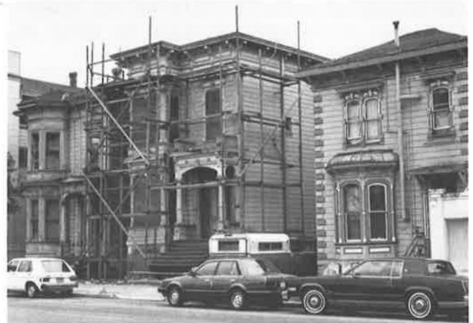
Wetmore houses on 11th Street (1876-85): threatened by downtown location and neglect.