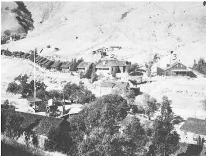
The Treadwell company town of Tesla, now totally vanished, had homes, company store, and church.