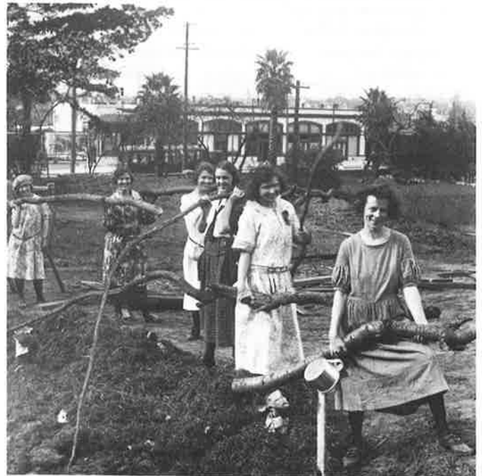
Art students clear the grounds along Broadway, as the college prepares to move in.

boundless enthusiasm and love of plants and animals. His kindness and sensitivity were tempered by occasional bursts of Teutonic bluster." Stories abound of his German frugality and resourcefulness. He and the students built what was called Guild Hall from used lumber from street forms used in the construction of Broadway. They salvaged bricks and even bed springs after old St. Mary's College on Broadway burned down.