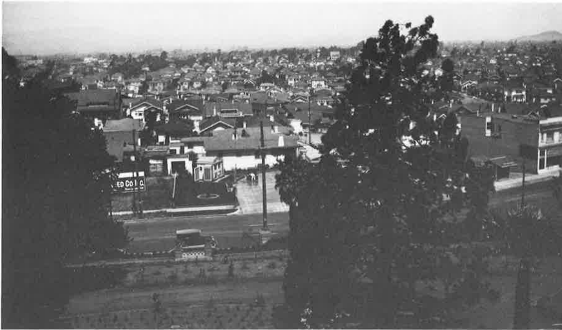
The view down the hill and across North Oakland in 1923, when CCAC acquired the property. Wall, palms, and waiting shed are same ones seen on p.5.