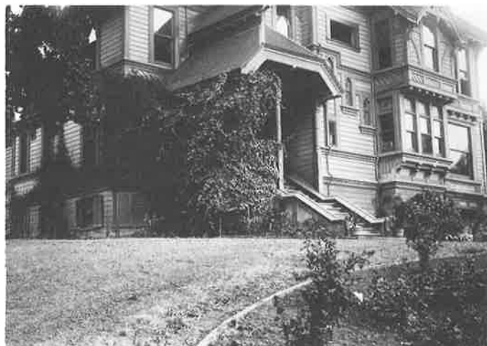
Crisply detailed but sadly incomplete photo of the house in 1923, when Meyer bought it from the Treadwells.

So it may never be possible to prove conclusively whether he designed this