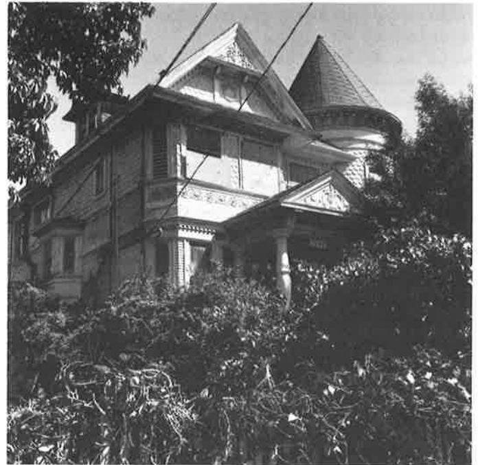
3148 Fruitvale, after the fire.