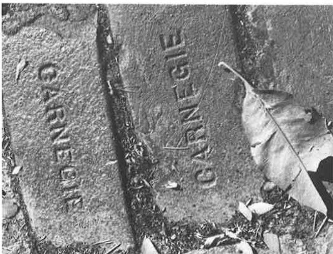
Carnegie bricks from the Treadwells' south county plant pave the walks at CCAC.