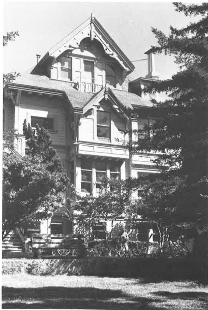
Now known as Macky Hall, the tall Stick mansion presides over North Broadway and the bustling California College of Arts and Crafts. (Phil Bellman)

Amidst the college grounds stands Macky Hall, a well preserved Stick-Eastlake mansion which today houses offices. The venerable old house looks down through towering trees upon the busy intersection of College and Broadway. San Francisco and the Golden Gate--now bridged--are visible in the distance. How did this house come to be here and who were its occupants?