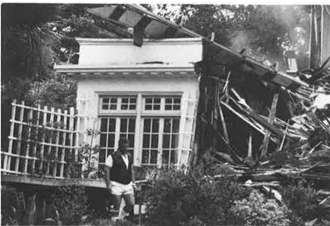
Maxwell House, 285 Lee Street, reduced to splinters - a quick morning's work. Last to fall was the arboretum at left.