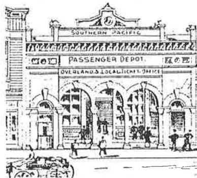
Central Pacific Depot, 464 7th St., in 1896 ( Illustrated Directory ) and today: altered but still historic. Board discusses treatment of non-visual landmarks. (Survey photo)

This system (unlike the National Register) would continue to allow landmarks like the Central Pacific Depot (Mi Rancho, 464 7th St.) and Southern Pacific Mole site, where the buildings themselves have been completely altered or even demolished but the historic site is landmarked. Buckley thought there might be 500 to 1000 eligible