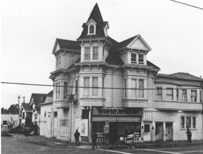
Corner store at 32nd and Adeline: outstanding building to be researched in the Clawson neighborhood. (Survey photo)