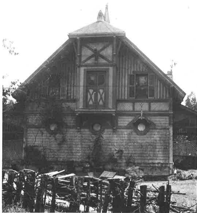
Carriage house in its original state, c.1922, with half-timbering, octagonal portholes, roof ornaments, and Stick style geometric trim.