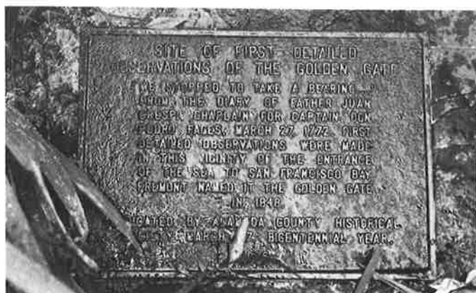
Hilltop's recorded history spans 215 years. Plaque at CCAC marks Fages Party's historic stop.