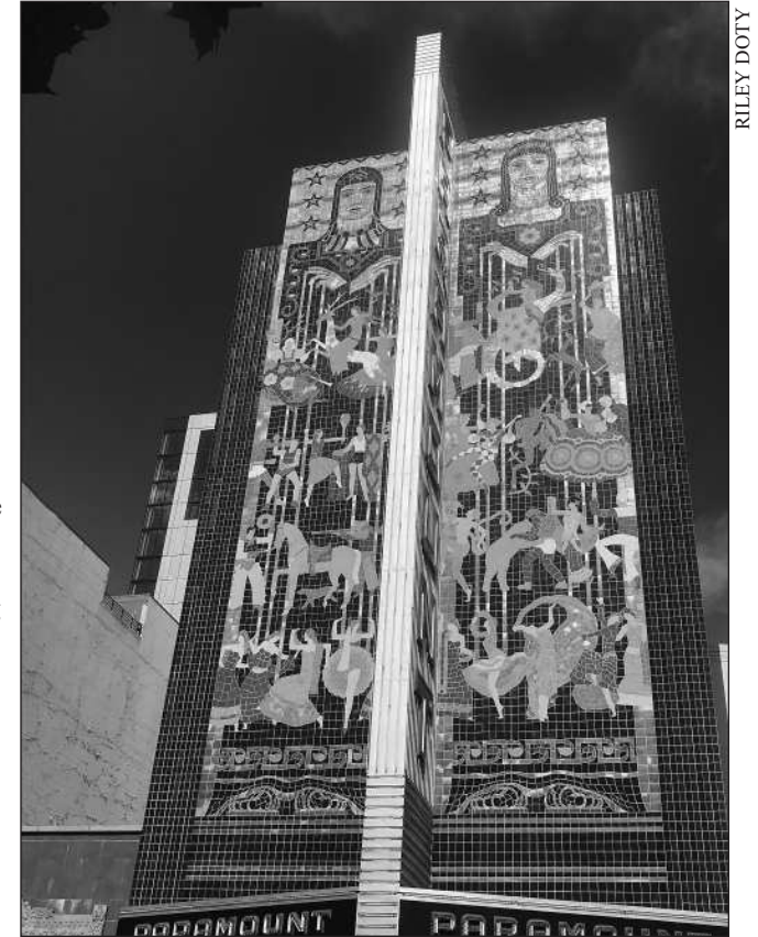
THE PARAMOUNT THEATER'S puppeteers.

The AC Transit bench across Broadway from the theater provides the ultimate view-