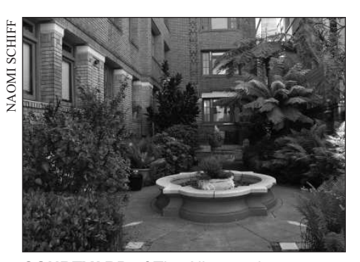
COURTYARD of The Alison today.

It was the Hotel Oakland that gave the new district north of 14th Street its cachet. The hotel was the brainchild of the business community, many of whose members were recent transplants from the rubble of San Francisco. By September 1906, five months after the earthquake, they were already planning what would be called Oakland's "BIG CARA-VANSARY" in the Tribune 's 1912 year book. The hotel, which would take up the block bordered by 13th, 14th, Harrison, and Alice