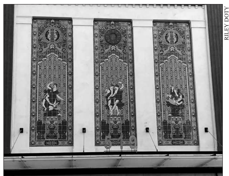
THE DUFWIN THEATER: Next time you wander by, look up!

The building's overall design represents a compromise position in response to the impulse to downplay decorative elements, to keep them low profile and preserve the clean lines of increasingly streamlined composi-