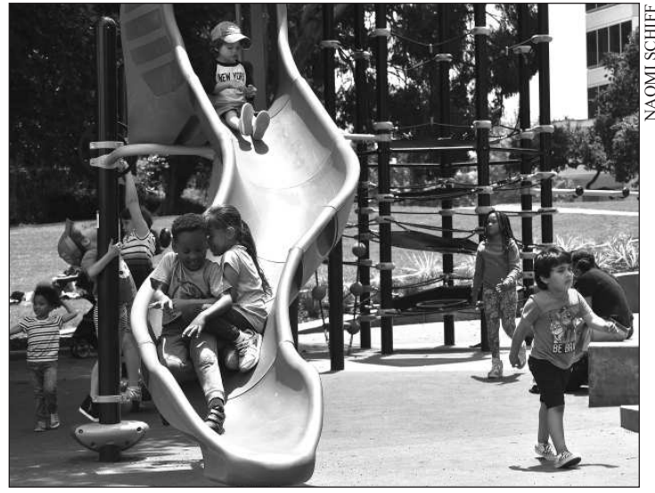
KIDS PLAY at Snow Park. We hope to see them become future OHA participants and board members!

need help with walking tours as well as volunteers to attend Landmark Preservation Advisory Board hearings, Design Review Committee meetings, and developer presentations. To volunteer, please e-mail us at info@oaklandheritage.org. Put out the word that OHA seeks more energy and involvement, and wants your help as we diversify.