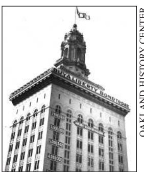
CITY HALL was a giant WWI fundraising meter for Liberty Bonds.

Research led me to files of correspondence and monthly reports from the Snow Museum, which was the first site of the zoo in what is now Snow Park. I wasn't expecting to find a connection to the World War II posters in the monthly reports