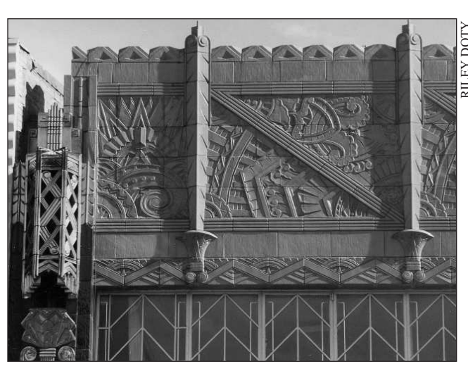
MARY BOWLES BUILDING, detail.

or possibly machine parts—none of it derived from classic sources. The panels are separated by thin vertical elements in sharp relief, which appear to be stylized torches with finials. On either end are heavy square pilasters, glossy black with dramatic silver accents. These terminate at the top with uniquely styled lamps which appear to be highly ceremonial and exotic, stepped at the base and having three