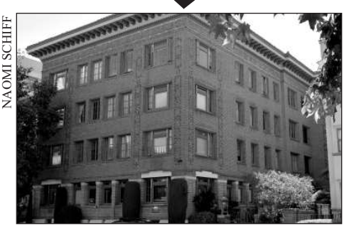
THE ALISON , formerly known as The Crystal Palace Apartments, in 2022.

streets, was to have 500 rooms to accommodate 750 guests. Public rooms were to include dining rooms, a ballroom, a room for lounging, a club room, and a smoking room—all to be decorated to suit the refined, expensive taste of Oakland's movers and shakers. A first-class hotel, they believed, was essential to make Oakland the West Coast's hub of commerce. More than a thousand of Oakland's elite celebrated the 1912 opening of the hotel with a dinner and a ball on Christmas Eve.