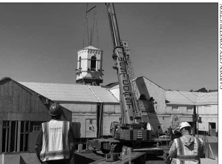
The Club Knoll tower being reinstalled

■ Club Knoll: The tower was reinstalled onto the building at the building's new site at Oak Knoll, where it will be part of a community center for 900-plus new residences.