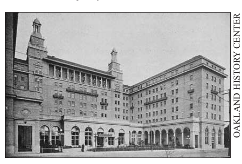
THE HOTEL OAKLAND in earlier days.

Although only down the street from the Hotel Oakland, The Palace's tenants would not be rubbing shoulders with the elite who made it their stomping ground. As they described themselves in the 1920 census, the employment of the majority of them was in the busi-