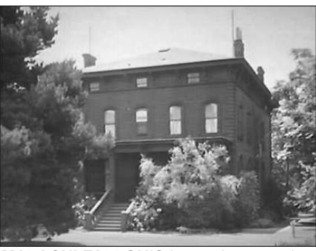
MALACHI FALLON'S home, later used as the Chabot Home.

The merciful endowment Of kindly pioneer Still stands, to grace our city, And hungry hearts to cheer!"