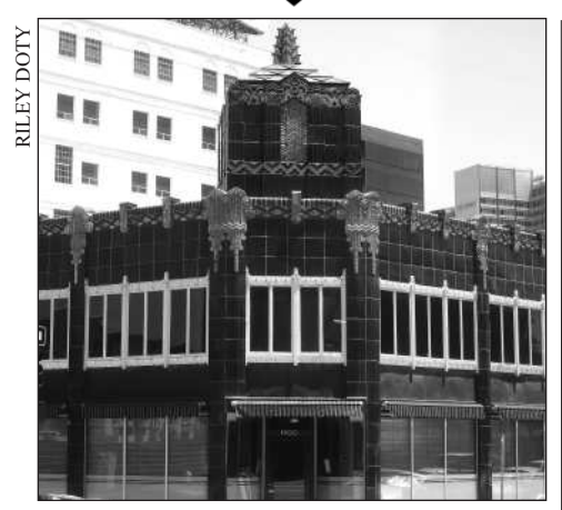
THE FLORAL DEPOT

But the influence of countervailing trends was constantly felt. This came largely in the form of an underlying pressure for building designs that were flatter and more simplified in form. This interaction between contending styles was something that was being played out on a national scale. As Art Deco designers searched for a new card to play, they introduced the use of color into the mix. A crop of colorful modernistic buildings suddenly appeared in several American cities. Instead of imitating other materials, their terra cotta exteriors now unabashedly proclaimed their ceramic character, as if they were giant pieces of colorfully glazed pottery.