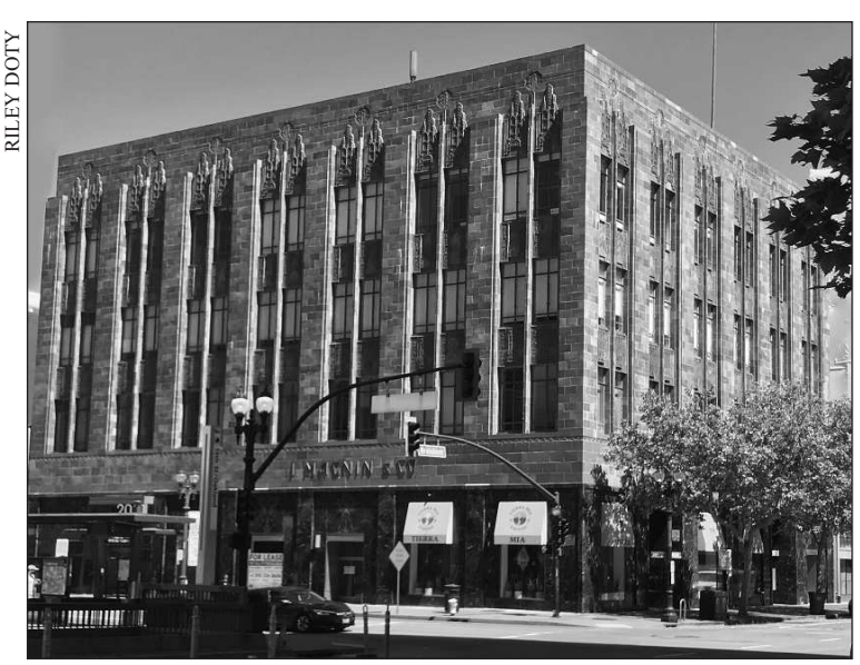
THE I. MAGNIN BUILDING