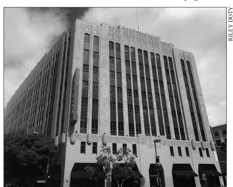
THE BREUNER BUILDING