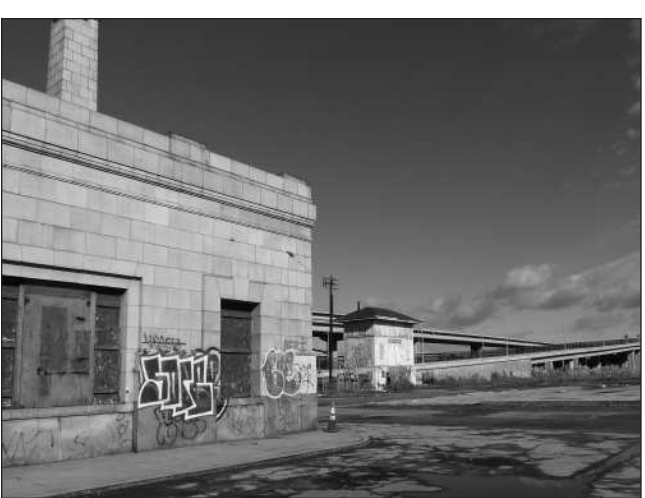
THE SIGNAL TOWER is visible north of the 16th Street Station's baggage wing