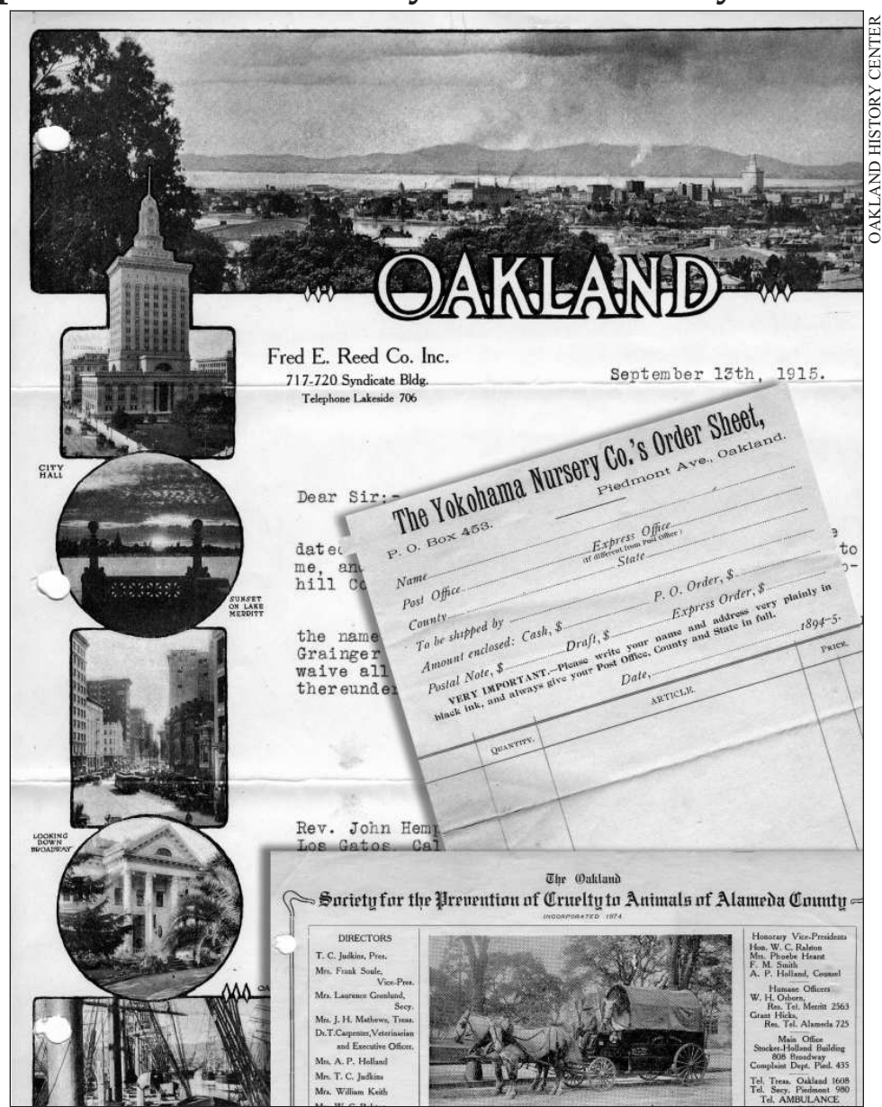
THREE LETTERHEADS from the newly digitized Oakland Letterhead Collection.

Also new: The Black Press in Oakland, an exhibit co-curated by OHC and the Main Library's Magazine and Newspaper Department, is on display through April 30.