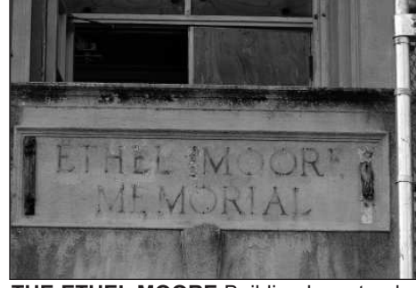
THE ETHEL MOORE Building has stood empty for years.

The 1912 16th Street Station was an early multi-modal center; Southern Pacific's East Bay Electric lines used an elevated platform on the second story, which still stands, and Key System cars traveled the tracks in front of the station. A signal tower a little further north is part of the historic complex.