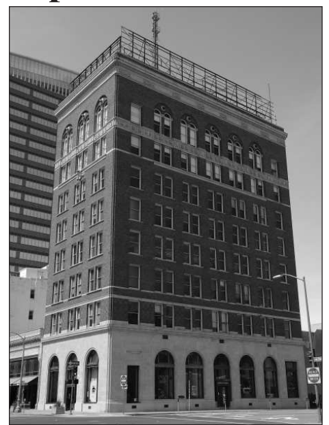
ALTHOUGH PG&E has moved its headquarters from San Francisco to 300 Lakeside, the former Kaiser headquarters, it is no stranger to Oakland. The handsome 1922 building at 1625 Clay St. was designed for PG&E by C. W. Dickey.