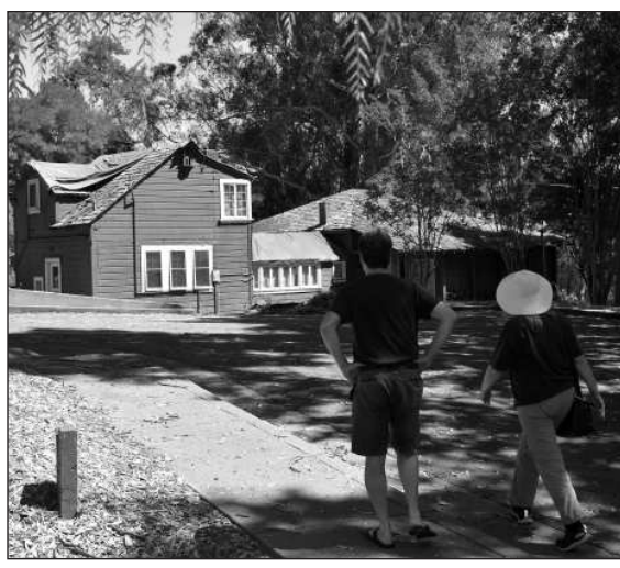
THE GEORGE MCCREA HOUSE was built near a Native American encampment.

historic value, and stands in an area slated for increasing residential development. It was the headquarters of the West Coast Railway Porters Union, headed up by A. Phillip Randolph and C. L. Dellums, and thus a locus of national labor and political organizing for Black citizens. In 2005, Bridge Housing proposed demolishing the Baggage Wing, but a loud outcry saved that part of the building. It turned out this was an integral part of the structure, not an addition.