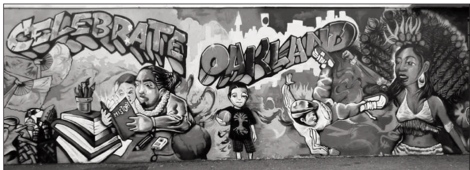
THIS BEAUTIFUL MURAL at Elmhurst Middle School isn't visible from the street, but you can see it at https://oaklandmurals.com/celebrate-oakland/