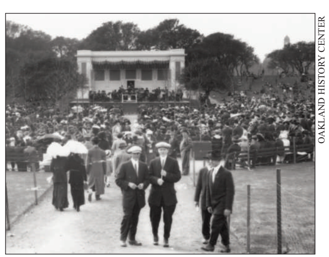
ONE HAD TO DRESS DAPPER for the band concerts

Some concerts offered extras. Attendees on Oct. 24, 1915, were treated to a demonstration of Lake Merritt water rescue protocols during intermission, at a concert