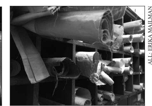
BEAUTIFUL HANDWRITING in the Index of the Dead shows Alice Pardee as the third entry on the page, top left, while more of the index books are seen above. Fragile, antique plot maps seem as if they will fall apart when unrolled, at top right.