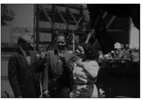
FRIENDS OF THE BEAN FAMILY in Oakland enjoy leisure time in a backyard garden party in the 1950s, a still from the Sandra Bean Home Movie Collection.

As with other museums, archives, and heritage organizations where historians go to practice their craft, we at the African American Museum and Library at Oakland (AAMLO) have had to adapt to the unique challenges of life under COVID-19. This involved stretching our creativity to move programming, exhibitions, and tours to a vir-