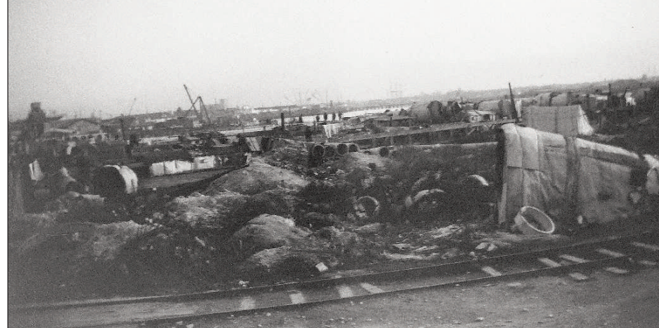
PIPE CITY on the edge of the railroad tracks, another Harry Goodall image.

"Mayor" Dutch Jansen, the short-lived shanty town existed from January to April of 1933. An article in the March 15 Oakland Tribune described Pipe City as "a curious and striking combination of extreme individualism and effective organization." Jansen selected 18 captains to oversee an assigned residential area of about 10 pipes. Captains were responsible for keeping their assigned sections in order and residents well-behaved. The pipes were 8 feet long by 4 feet wide. Residents usually placed a mattress and blankets inside, then covered the pipe openings with found materials such as tarred paper for weatherproofing. The American Concrete and Steel Pipe Company allowed men to take shelter and even provided running water irrigation through the grounds for occupants' nourishment and sanitation, as reported in the Feb. 24 Dunsmuir News that year.