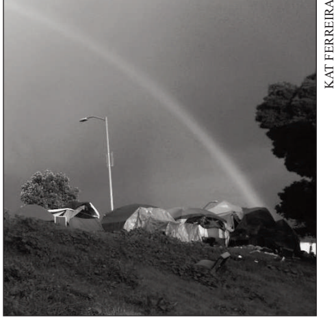
RAINBOW over houseless community located at 16th Avenue and East 12th Street in January 2017.

We are witnessing history in how this shapes local political movements such as Moms 4 Housing, led by community organizer and recently-elected Oakland Councilmember Carroll Fife. Garnering international media attention, the strategic act of civil disobedience of Moms 4 Housing highlighted the injustice of the region's latest housing crisis. Working mothers and their children peacefully occupied a vacant house purchased by one of the largest real estate speculators in the country, Wedgewood Properties. The campaign for a more just and fair housing alternative was a success. Wedgewood agreed to sell the home to the Oakland Community Land Trust and provide the Trust with the first right of purchase for the 200 other properties Wedgewood owns in Oakland. Plus, new local and state laws have been enacted to protect tenants in the future. With slogans like "housing is a human right"