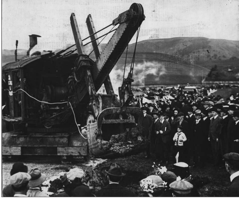
BREAKING GROUND for the new Chevrolet plant in East Oakland, 1915.

Calisphere is a University of Californiaadministered repository that allows users to search digital collections at UC campuses and hundreds of statewide partner institutions such as the California Historical