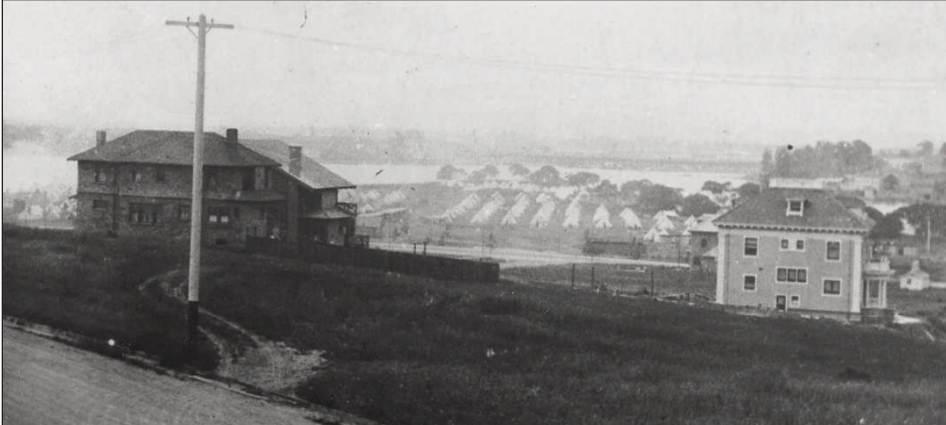
A TENT CITY set up in Adam's Point on the edge of Lake Merritt to house San Francisco refugees after the 1906 earthquake and fire.