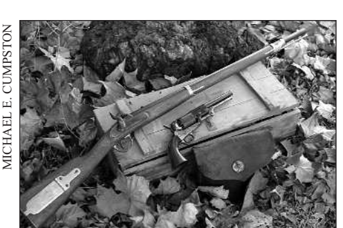
REPLICA OF AN 1841 Mississippi Yager rifle with a Colt .44 "dragoon."

Both parties could board a ferry in San Francisco to travel across the bay and into San Antonio Slough. If the tides were right and sand bars did not interfere, they could