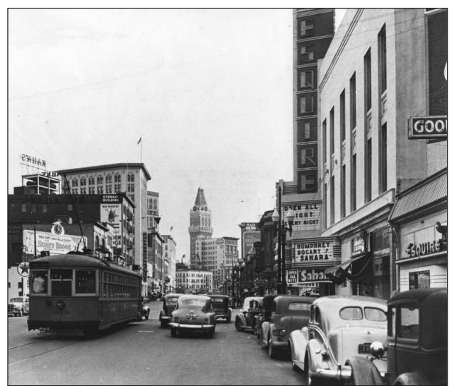
THE ESQUIRE THEATER on San Pablo Avenue near 17th Street, 1943.

You can also find curated special collections and topical exhibitions on Calisphere which are great resources for researchers and teachers. The link for OHC's collections is