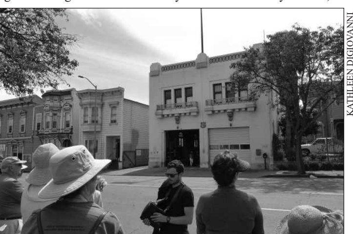
A 2015 OHA TOUR visited Oakland landmark Fire Station #4: if replaced, what would be its new use?

The station moved from East 12th Street to its current address in 1874. Today's station was built in 1909, according to building permit records. It was designed by Oakland architect Fred Soderberg who had an active practice in Oakland in the first quarter of the 20th century. Besides the Brooklyn station,