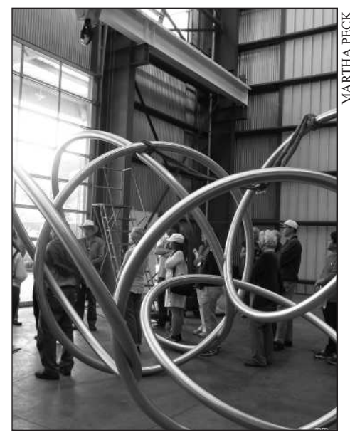
OHA TOUR in West Oakland visits Bruce Beasley's studio, 2015