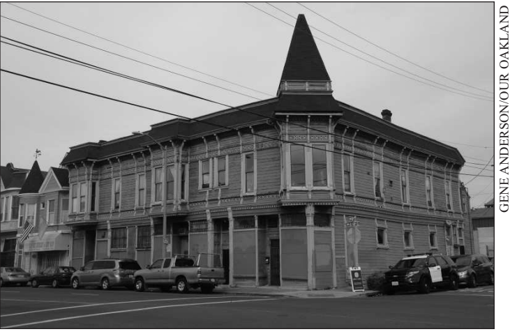
LANDMARK #58, the Williams Block on East 12th Street, is on the market in the Clinton/Brooklyn neighborhood.

stand under the 880 freeway, cut off to make way for the overhead lanes. As a historic landmark, the State Historic Preservation Office has to concur in a memorandum of understanding with CalTrans, and a federal "section 106" review. One outcome will likely be a contribution of $100,000 to help fund the city's Facade Improve-