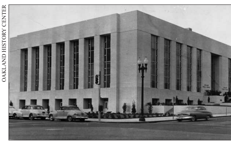
HISTORIC MAIN LIBRARY , designed by Miller-Warnecke, architects, on the day of its dedication in January 1951.

The venerable Williams Block, built in 1885, Oakland Landmark #58 in downtown Clinton, was recently advertised for sale. Eager community members hope to see it stabilized and gently repaired. Here's a bit of language from the landmark designation document: "The second story originally contained offices and lodging rooms, while the street level housed a grocery store, dry goods store and dressmaker. The building is a good example of the business blocks that were erected in the old Clinton/Brooklyn commercial district . . . . "