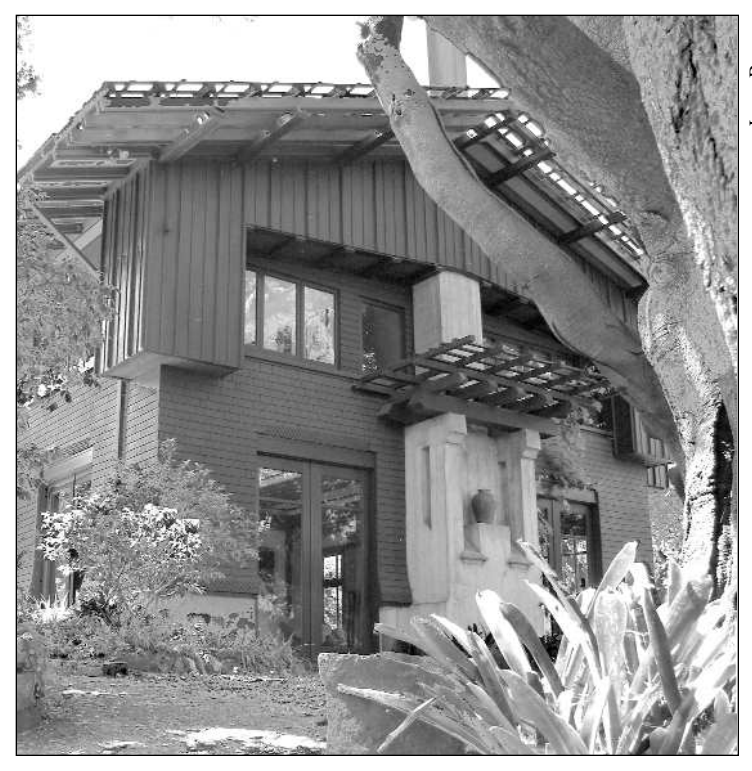
THIS UNUSUAL CRAFTSMAN HOME on Chabot Road narrowly escaped the Hills fire. It is a superb example of the work of Bernard Maybeck, notably for use of color on a shingle residence.

Another example of a lost estate is Brougher's (Brewer) Castle. This large two and half story house had a tower with a machicolated cornice, hence the name.