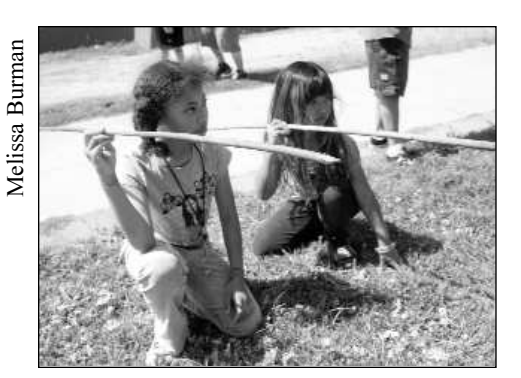
GIRLS LEARN TO THROW JAVELINS the Ohlone way at a Peralta Hacienda rancho festival.

You would never have known there was a crisis when 120 parents gathered recently for the final community banquet of the summer program. Their kids aged four to 14 had learned history by playing Ohlone games and starting a fire from a flint and stick.