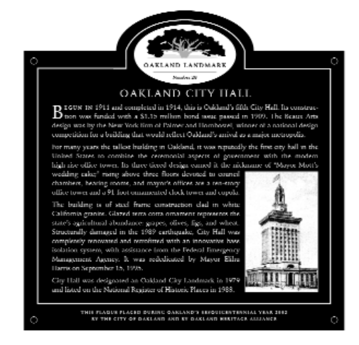
THE HISTORIC PLAQUE design we may see more of in the future.

Despite the existence of our Historic Preservation Element, no clear path was articulated for how to frame the discussion, especially in cases where no EIR was required under state regulation. The new ordinance attempts to assure that qualified, impartial experts will be key participants in