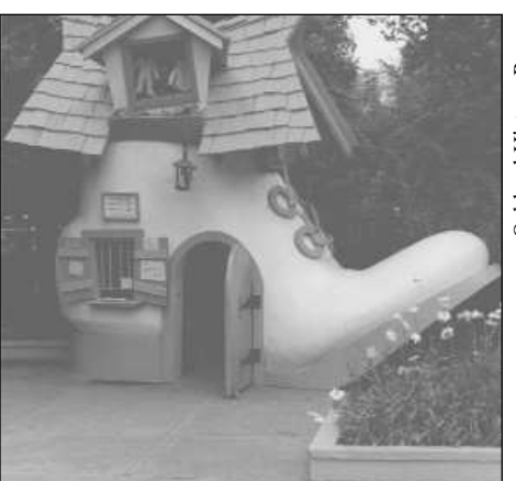
THE OLD WOMAN'S SHOE has welcomed children to Fairyland for 60 years.

The Owl and the Pussycat debuted at Fairyland's 19th birthday in 1969. It was a