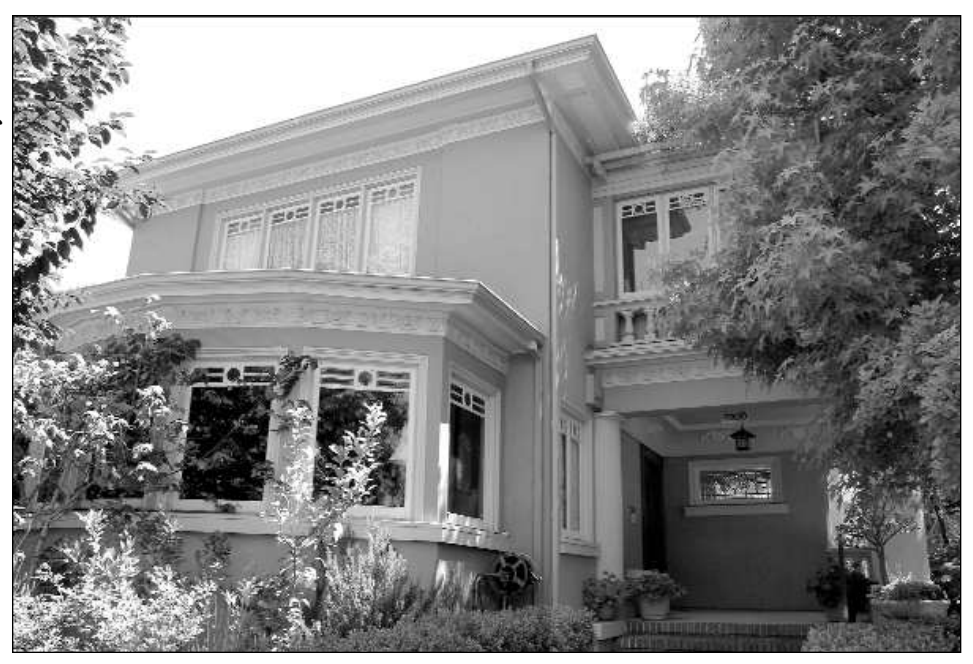
BUILT IN 1916, THIS HOUSE is a rare local example of the Prairie Style, with unusual features on both the exterior and interior.