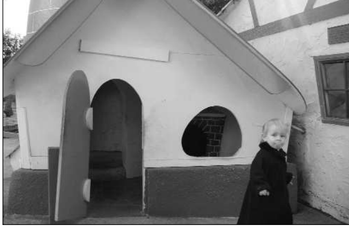
WHIMSICAL, MINIATURE ARCHITECTURE has long made Children's Fairyland a favorite.