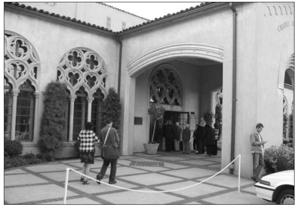
VISITORS ARRIVE at Chapel of the Chimes for the awards ceremony.

The first sign, "The Railroad History of Shepherd Canyon," details the history of the railroad, including the stops in Shepherd Canyon and Montclair village. This early form of mass transit shows that it is not just an idea for the future! The second sign, "Shepherd Canyon: The Highway that Almost Was," tells the story of plans for Highway 77 along the then-abandoned rightof-way which Caltrans had purchased. Citizen activism seeking to cancel the highway plans and promoting ridership on the BART