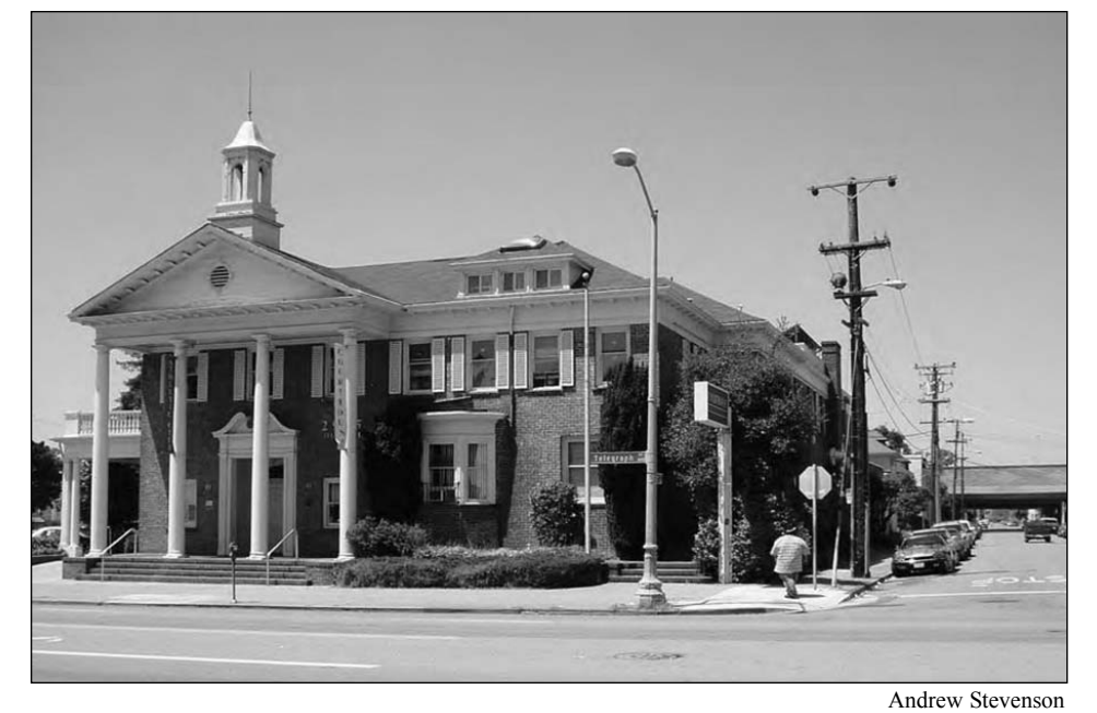
THE COLONIAL REVIVAL FACADE of the Courthouse Athletic Club is unusual.

Inertia is a strange phenomenon: once you start something in motion, it may continue moving, however improbably. That's what we have with the Courthouse condos project that was launched in 2005. With some notable downtime and an interrupted back room sale, the phantom project/demolition scenario continues to this day.