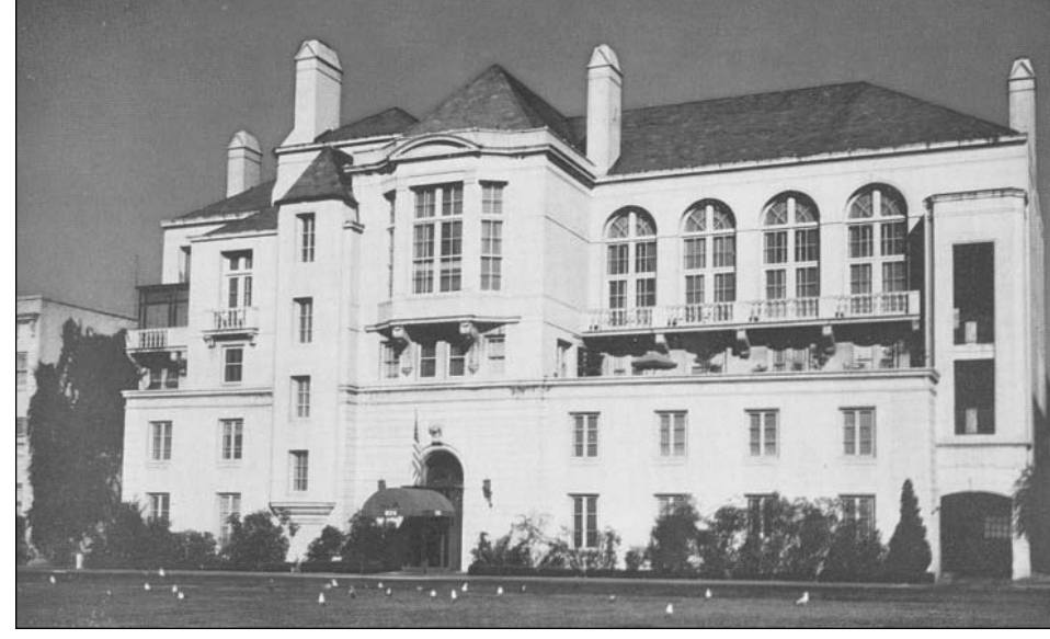
THE BELLEVUE CLUB seeks National Register status.