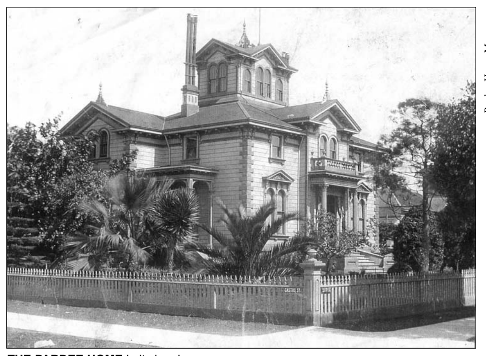
THE PARDEE HOME in its heyday.

Do you think the home is worth saving? Have you ever taken a tour? Perhaps there would be no better time. ■