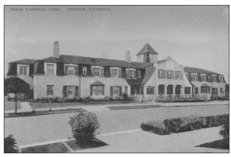
AN UNDATED, hand-colored postcard of the home.

The pages of "The Messenger" monthly tracked the Home's progress, from its conception through the completion of the main building and well beyond. Someone clipped and carefully pasted those articles into the Home's scrapbook along with photographs of Home events over several decades. The scrapbook also includes an undated list of House Rules including the following: "Radios are not to be used before seven