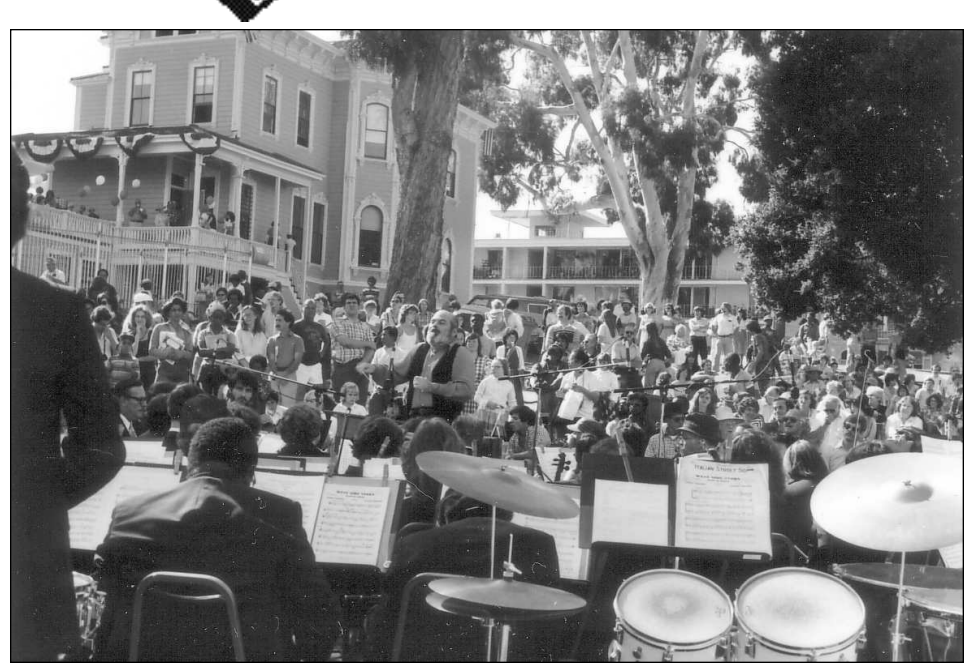
ONE OF OHA'S ACHIEVEMENTS was the Preservation Fair that took place September 20, 1981. Hundreds attended. Above, a band plays in front of the festive crowd at the Camron-Stanford House. At right, a member mans the OHA booth at the fair.

I don't know if it was an amazing moment; it was a process. I was on the original board. Because the planning committee on that board was basically people who were on the planning committee for the Oakland Cultural Heritage Survey, there was a diverse group