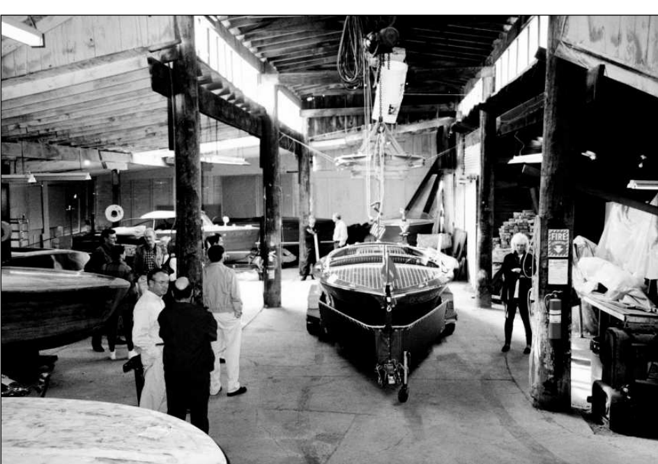
PHILBRICK BOAT WORKS: The workshop in the 1950s, top, and in the 1990s.

Once there were as many as 20 wooden boat builders practicing their trade along the Oakland Estuary. It's part of Oakland's heritage as a waterfront city. But the rising cost of exotic