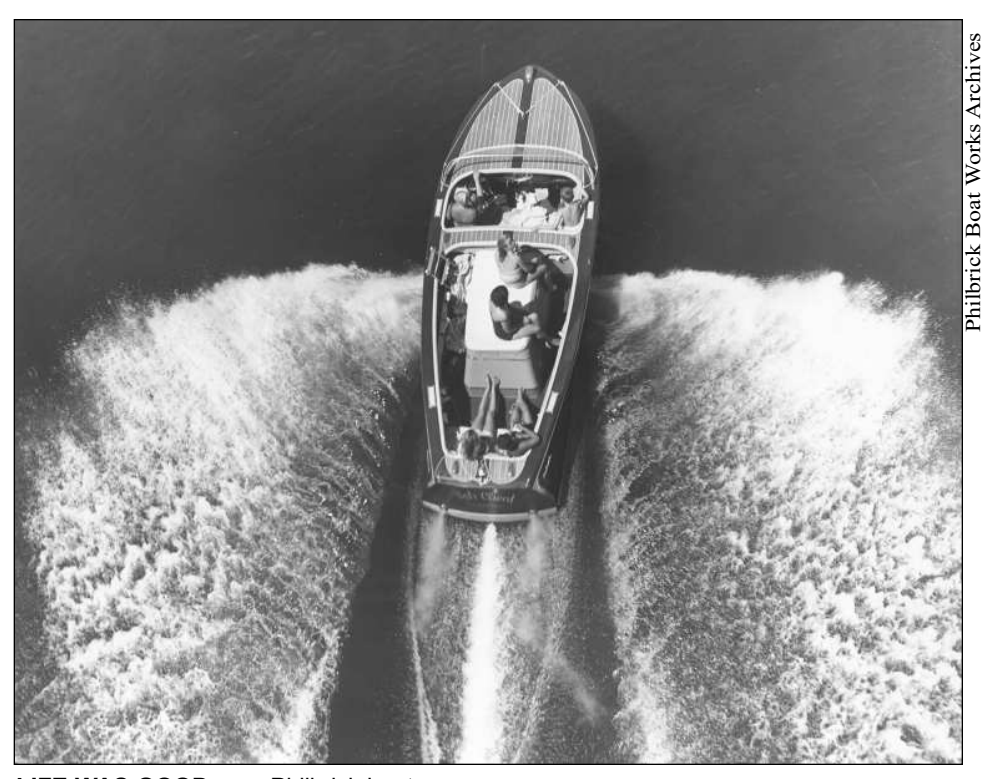
LIFE WAS GOOD on a Philbrick boat.

The boats that Don most loved to build were also the most difficult: the beautiful