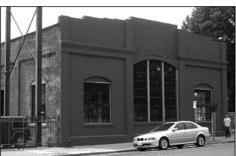
MILLS ACT PROGRAM assists a 1914 bungalow (top) and an 1891 railway barn.

different guest soloists each week. Yancie invites all of you to help maintain a vibrant jazz scene in Oakland. Come join him!