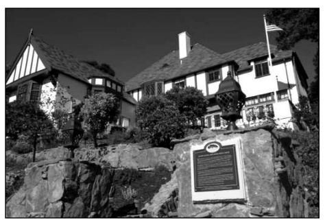
5654 MARGARIDO DRIVE

can edit. It's like Wikipedia in that it is an online encyclopedia built by volunteer contributors and holds a Creative Commons license, but differs in that it's exclusively about Oakland and includes many things that are considered "too small" or "not significant enough" for Wikipedia. Oakland Wiki launched in July 2012, starting with weekly volunteer meetings focused on gathering new contributors. Oakland Wiki experi-