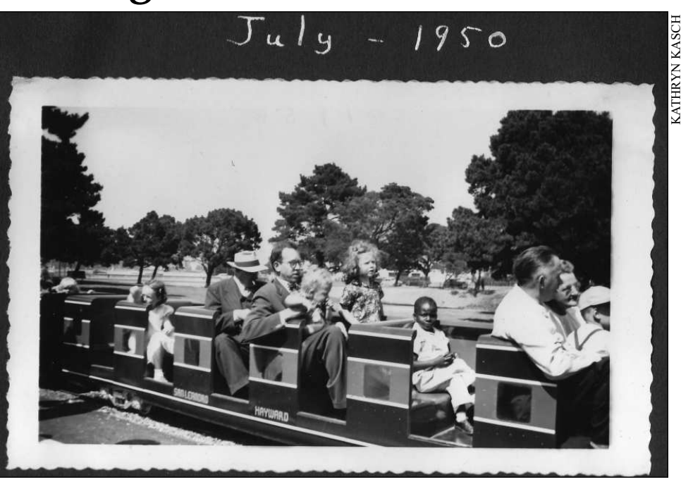
THIS MINIATURE STEAM ENGINE once operated near Lake Merritt.

All of this made me curious to learn more about Peralta Park and the train, so of course I went to the Oakland History Room and the newspaper files at the Main Library. The land was purchased in 1898 from Oakland Waterfront Co. (Southern Pacific Railroad) and in