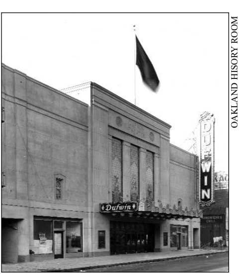
THE DUFWIN in earlier days.