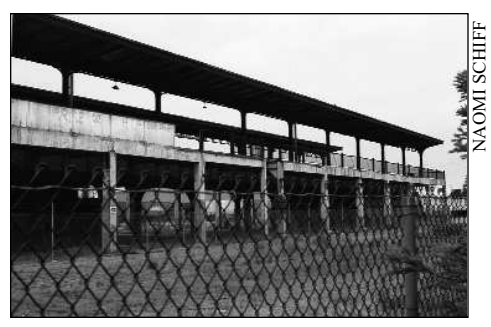
WOOD STREET STATION'S platform, which could potentially use tax credits.

the exteriors of many important structures. The nature of this medium will be examined, and its unique beauty highlighted. Emphasis will be given to its special needs in terms of maintenance, preservation, and restoration. Afterwards, from 3:00 to 3:30, there will be an optional tour of the inside of the Howden Building and also a chance to view historic photos of the buildings seen on the walking tour. A level walk. —Riley Doty