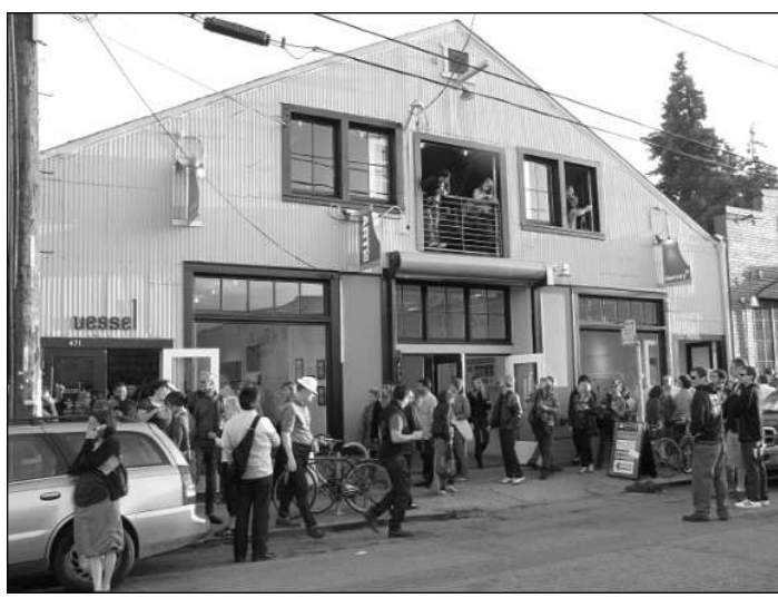
THRONGS of people check out the art at Oakland's Art Murmur studio events.