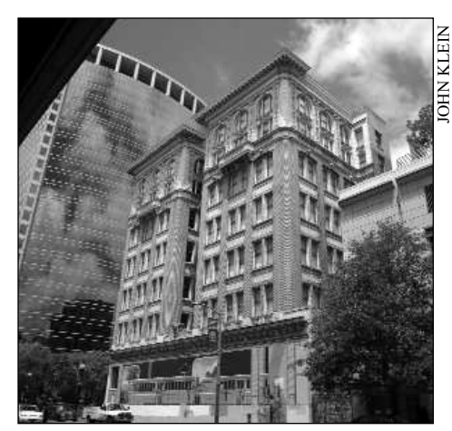
THE KEY SYSTEM BUILDING , 1100 Broadway, could use tax credits.