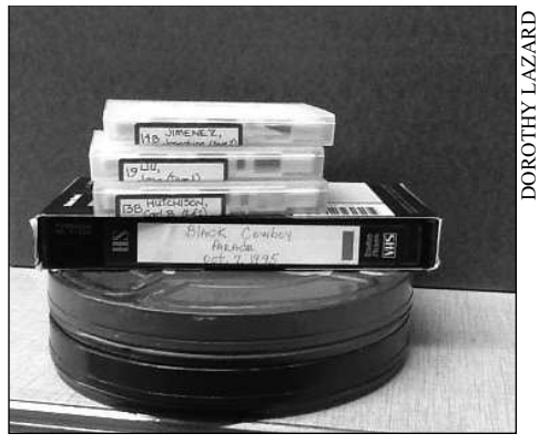
A SAMPLING OF THE FORMATS being digitized for the Oakland History Room by the California Audiovisual Preservation Project.

Since October, the Oakland History Room staff has nominated 67 items.