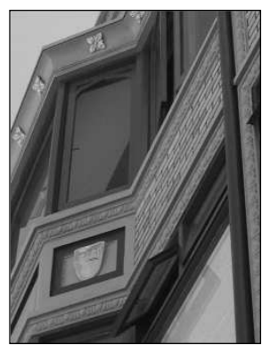
THE ROSS STREET HOUSE, left, and at top, a detail of the White Building.

Each detail in the finished work passes the tests of being authentic to the period, in keeping with the character of the house, and a delight to the eye. Many original features were discovered from photographs or evidence found during demolition, and these were recreated; otherwise missing elements were newly created, designed sympathetically to the existing materials and character.