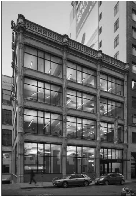
GIRLS INC. SIMPSON CENTER, once a water company building.