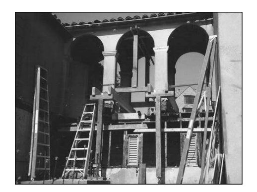
GENESY HOUSE , undergoing reconstruction, above, and at peace, right.

He faced numerous challenges, beginning with restrictions to the drive-through fast food concept the structure had originally been built to serve. While these restrictions were effectively used to prevent Kwik Way's conversion to a McDonald franchise, they