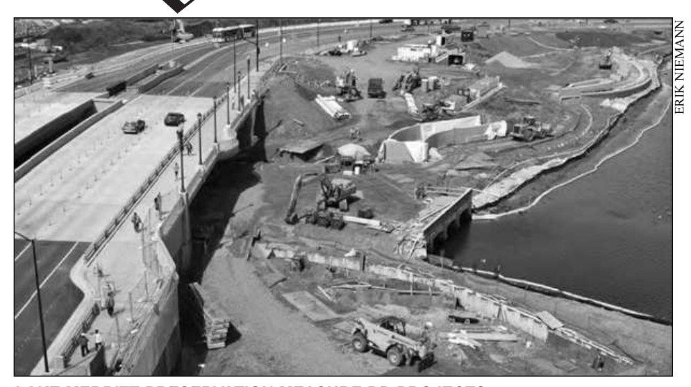
LAKE MERRITT PRESERVATION MEASURE DD PROJECTS

In November 2002, the Measure DD Bond issue passed overwhelmingly by 78%. This bond for $198 million gave a necessary addition to Lake Merritt—the funds to improve and restore it. They came available at the start of the current economic downturn and have served as a source of employment for many during the recession.