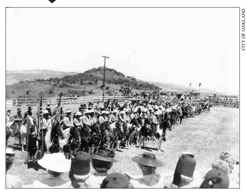
THE AAHMES SHRINE RANGERS Wild West events were immensely popular in Oakland during the post-World War II era.

delinquent. Others were just kids who loved riding horses.