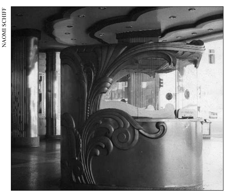
THE FOX TICKET BOOTH , circa 1975. See Aug. 18 tour description.

(five hangars, an administration building, and a hotel, built between 1927 and 1929) are largely intact. Afterwards you may visit the Oakland Aviation Museum (Adults $10. Seniors $9, Children 6-12 $5). Meet: Business Jet Center, 9351 Earhart Rd. (west on Hegenberger Rd. from 880, cross Doolittle. Immediately turn right on Earhart). Park in lot across from the building: assemble under the trees. Leader: Woody Minor