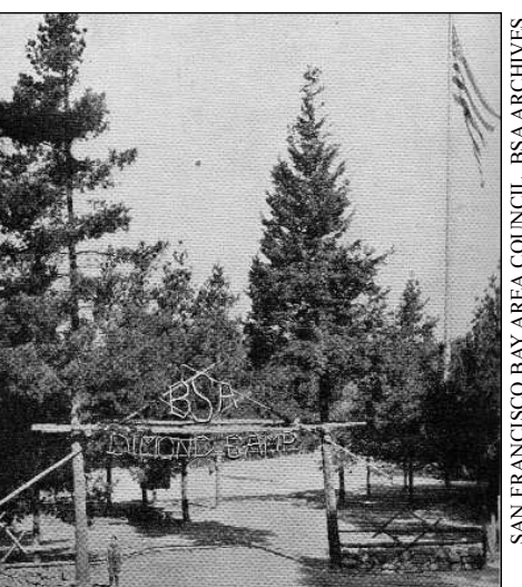
CAMP DIMOND entrance, 1921.

The rapid growth of the Oakland hills in the 1930s and '40s spelled the end for Camp Dimond, A 1945 school bond measure provided for the construction of new schools in