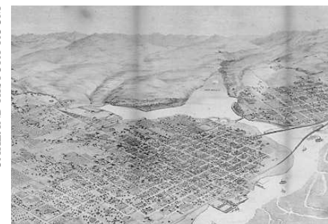
WHAT BECAME THE LAKE MERRITT CHANNEL is clearly shown as a wide opening, on this map from about 1840. See Aug. 11 tour description.