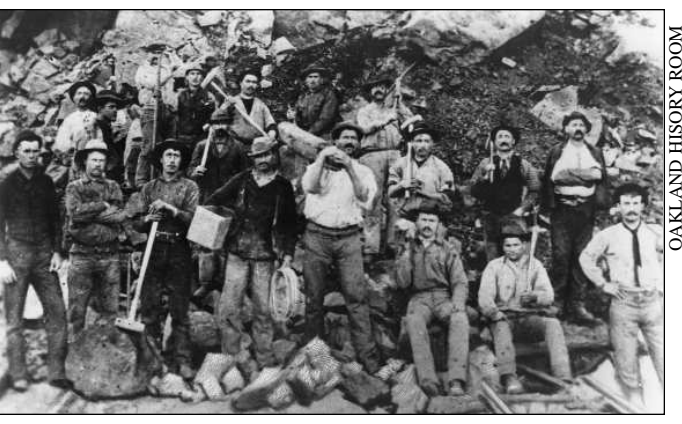
ITALIAN QUARRYMEN at Bilger Quarry, 1898.

Why is the old quarry filled with water now? The Claremont spent another $8,500 to turn it into an irrigation reservoir by diverting a branch of Glen Echo (formerly Cemetery)