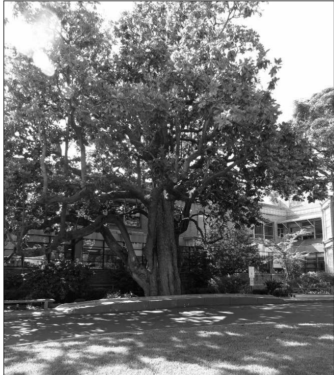
FATE OF AN ENORMOUS magnolia tree that stands next to the 1948 Baby Hospital addition looks bleak. Below left, a capital on the old Baby Hospital shows alternating children's heads and mythical winged creatures, and at right, a medallion of an infant is part of the terra cotta ornamentation on the hospital.

Revised plans will be shown to the Landmarks Board and Planning Commission by late November. ■