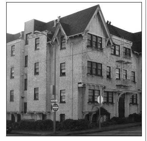
THE A-RATED 1910 Newsom apartment building stands on a prominent corner.

We and the Audubon Society also objected that the plan called for waiving Oakland's dark-skies standards and encouraging uplighting and large lit signage, despite the area's proximity to Lake Merritt—a key bird sanctuary, and an important wintering and rest stop on Pacific bird migration routes. ■